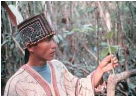
Shipibo Shaman with Amazon Herb

hands-on with the communities in the Rainforest and directly providing real assets and benefits there.”