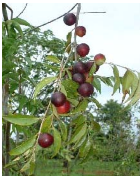
Camu Camu Berries

In addition chocolate may reduce oxidation of dangerous LDL cholesterol. In moderation it has been shown in a study to increase longevity, 2 and we all know the active mood-altering effects of this favorite treat. It acts as a mild aphrodisiac as well as helps fight depression. Scientists at the Neurosciences Institute in San Diego discovered that biologically active ingredients of chocolate also target a substance in the brain known to produce “internal bliss,” one of the most common reasons for eating chocolate. 3