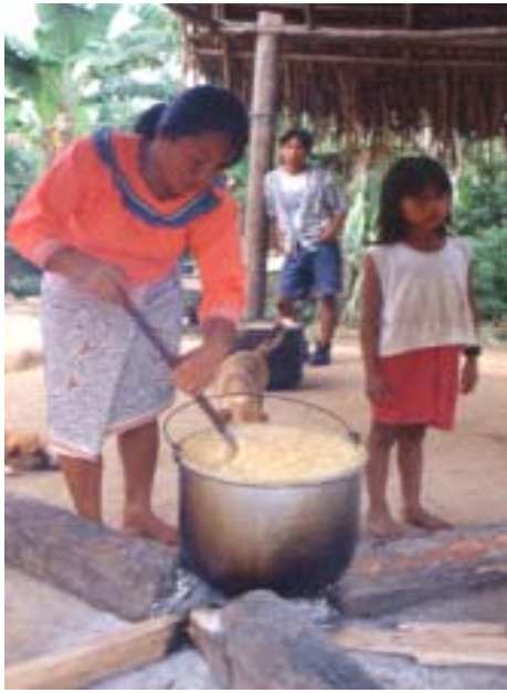
Native Shipibo Woman Cooking